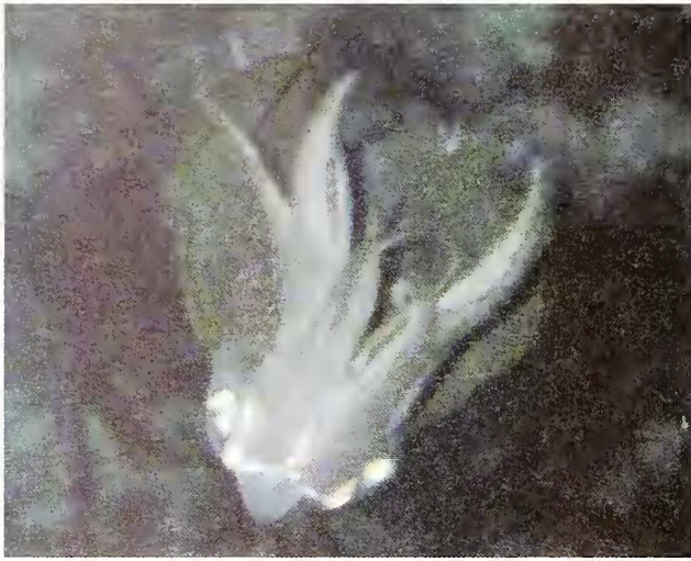
Fig. 5. Tremoctopus sp. in a shot by Goud (1989) in the Red Sea.